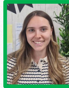
Moon Class Teacher and Forest School Lead