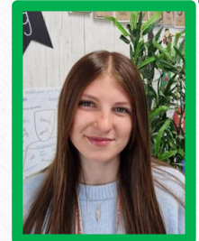
Apprentice Teaching Assistant