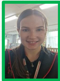
Star Class Teacher